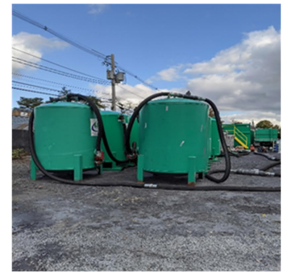
Water Treatment System