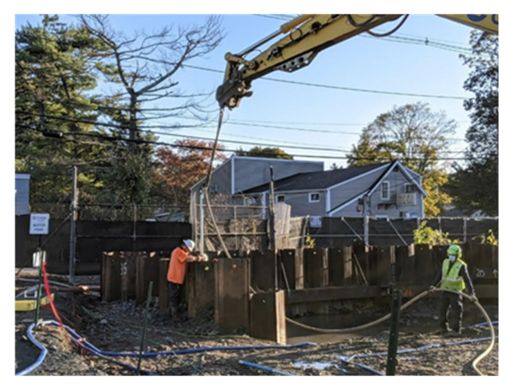
Installing Wellpoints for Dewatering

Website: LibertyUtilities.com/mthopestreetcleanup/ Email: mt-hope-street-clean-up@libertyutilities.com Telephone: (774) 627-2935